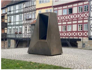
Plateau with display window to the Mikveh