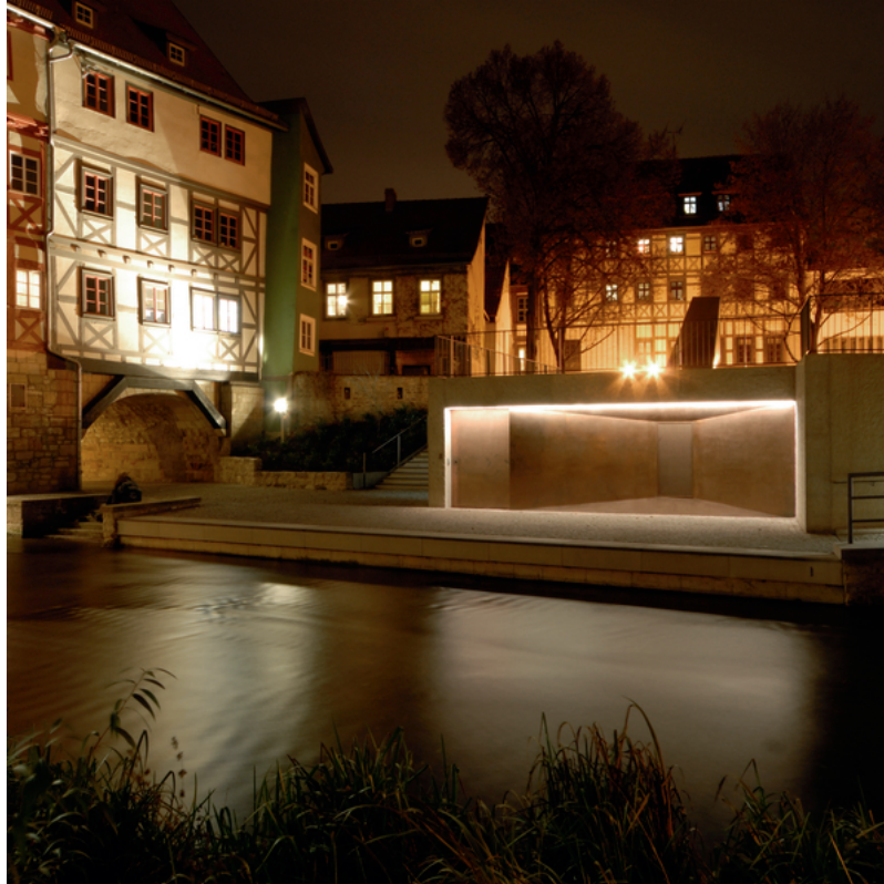
Mittelalterliche Mikwe in Erfurt