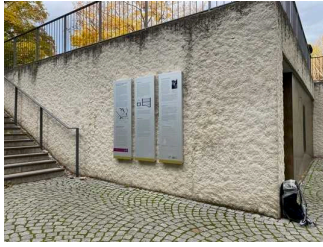
Entrance area – information boards in front of the entrance

We have put together some photos from the company / offer for you. You can find more photos in the detailed reports.