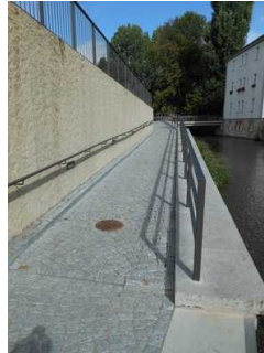
Ramp way to the mikveh