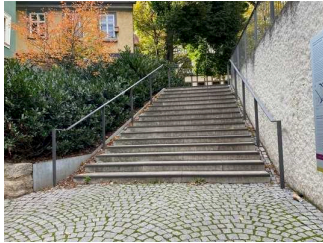
Stairs to the Mikveh