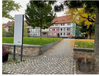
Outdoor path to the plateau with display window and the stairs to the Mikveh