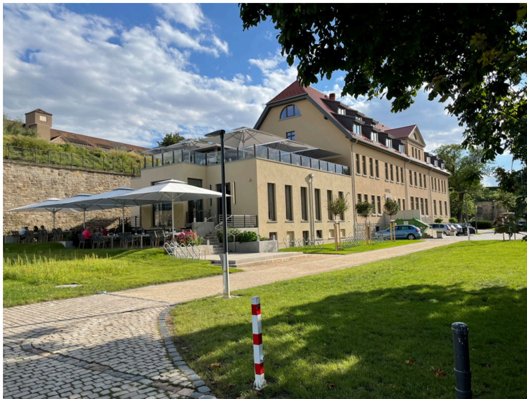
Restaurant PEBERG