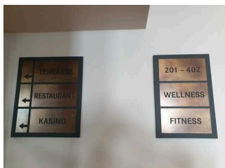
Operating elements / guidance system