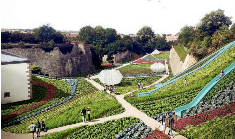
Visualisation of the moat / Heuschneider Landschaftsarchitekten

Paths and slides will provide access to show beds full of typical local vegetables and flowers, such as cauliflowers and broad beans, herbs, plants used in medicines and dyes, and classic fruit and flowering plants. Thousands of blooms will transform the former defensive walls into an atmospheric events venue.