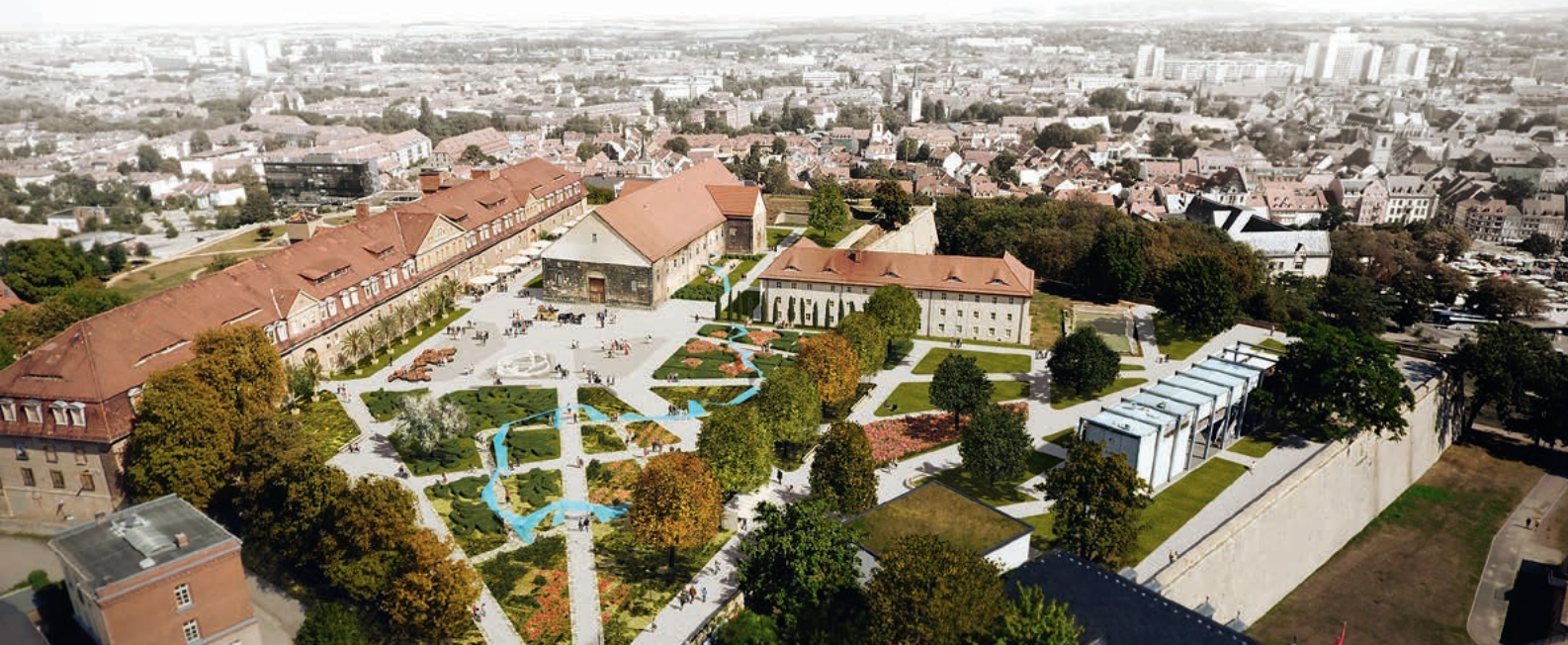
Visualisation of the upper level / Heuschneider Landschaftsarchitekten

Another highlight awaits visitors in the moat, where they can explore the history and heritage of garden design in Erfurt at close hand.