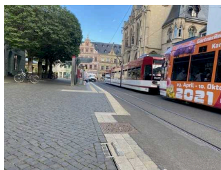
Tram stop "Fischmarkt" – lines 3/4/5/6