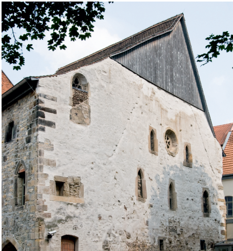
Old synagogue