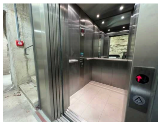
View into the elevator