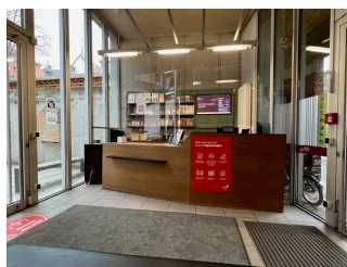
Information and cash desk