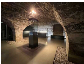
Exhibition in the museum old synagogue